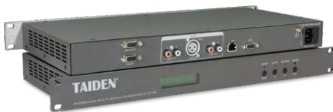
HCS-8316VGA-H VGA Encoder