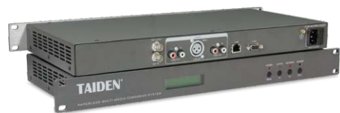
HCS-8316SDI SDI Encoder