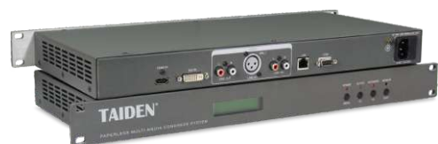
HCS-8316HDMI HDMI Encoder