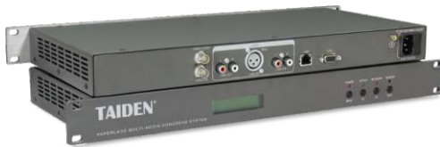
HCS-8316AV-H AV Encoder